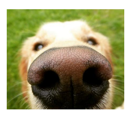
Think about where you are in relation to your pet ... above, eye level, below ... how can you get their attention ... what's in the background ... how many photos are you taking (the more the better). Other pets can also be used ...

A HAIKU HOW-TO Five syllables in the first line Seven syllables in the second line Five syllables in the last line